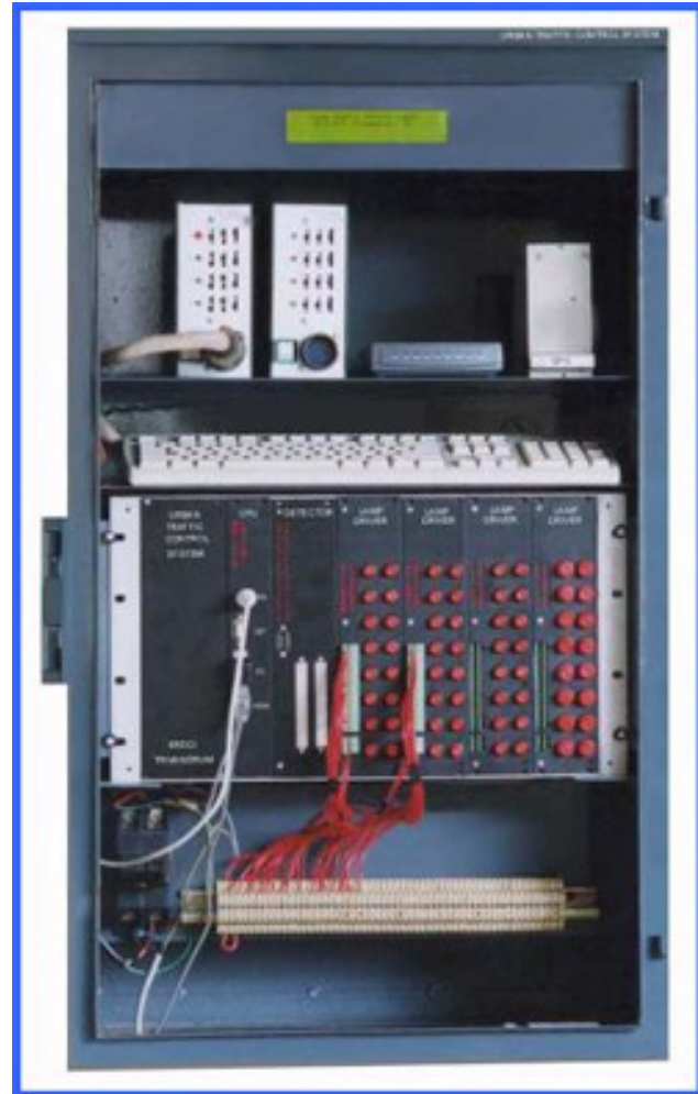
WML make ATCS Controller

The main components of ATCS Controller are as follows:-